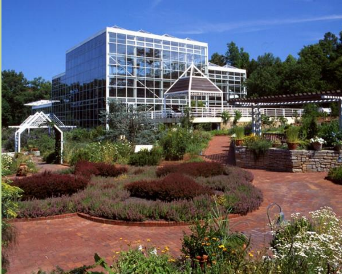
State Botanical Garden of Georgia