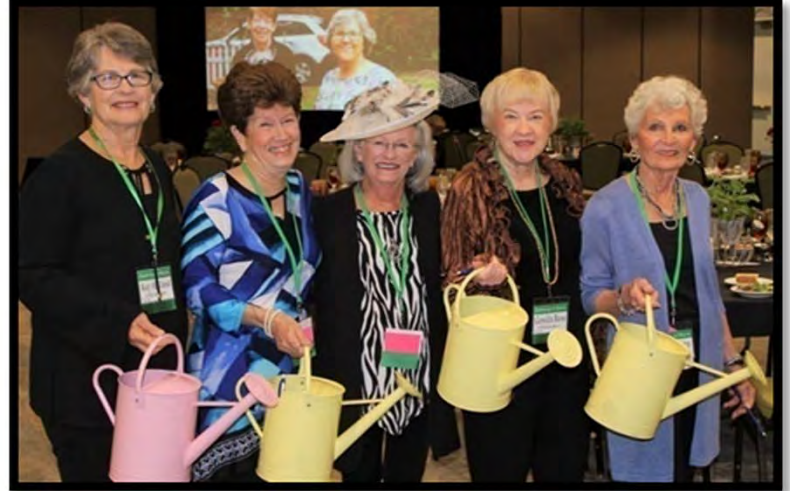
Hostess ladies collecting tickets at convention.