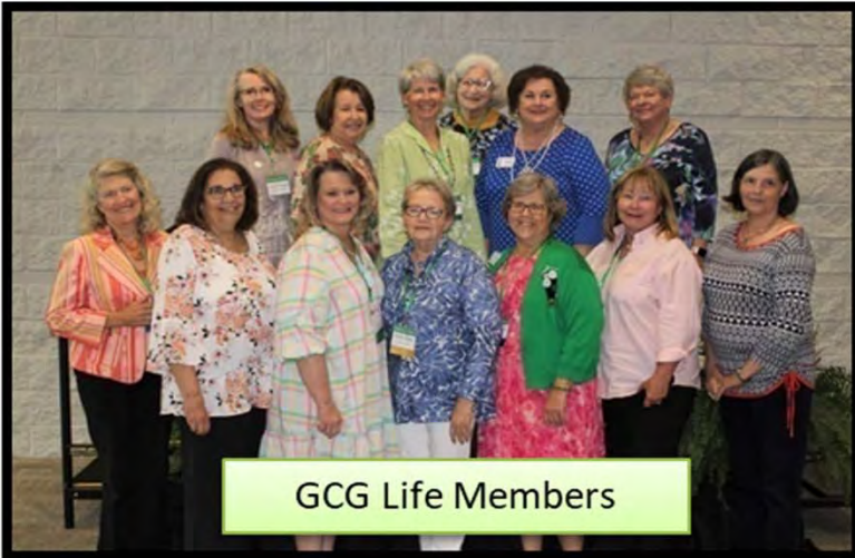
GCG Life Members