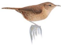
Wrens Cardinals Grosbeaks Mockingbirds & Thrashers

May attract: Attribute: Shrubs, Fruit, Butterflies, Caterpillars, Birds