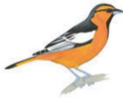
Chickadees & Titmice