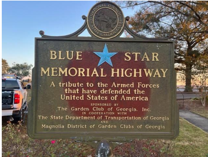
Photo left: Plains Welcome Center Blue Star Marker before Renovation

Someone noticed that a Blue Star Memorial Highway marker was looking a little worn. So, one fine Saturday in October of 2022, the Blue Star Marker located in Plains, Georgia at the Welcome Center on GA Highway 280 got a wonderful face lift by restoration expert,