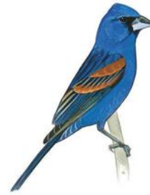
Orioles Thrushes Sparrows