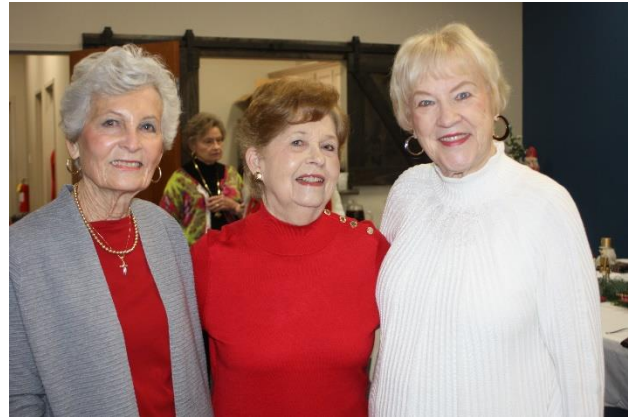
The Sprig-N-Dig Garden Club Christmas Brunch on December 13, 2022. Each Member brought a gift bag filled with toiletries, candy, socks, etc. to be given to a person who would not be getting a gift otherwise at the Pineland Mental Health New Beginnings Program, Statesboro, GA.