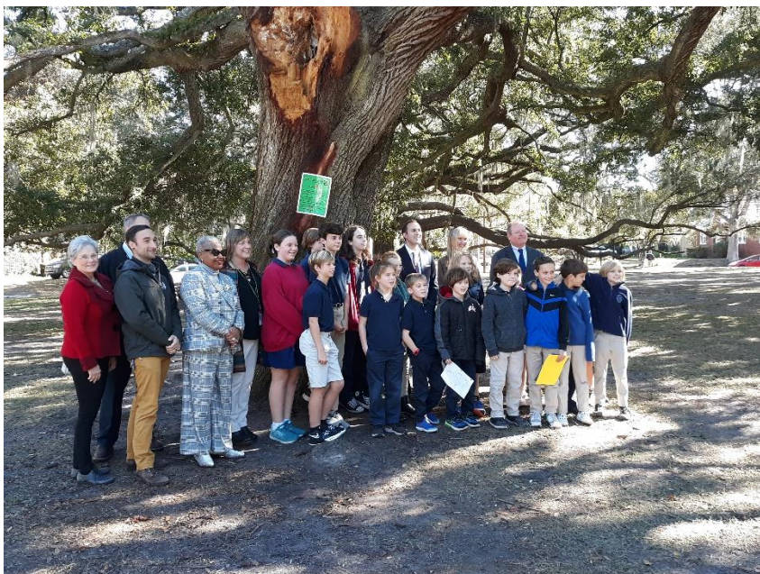
The city of Savannah does intend to plant another live oak in its place. A tree planting ceremony is scheduled for spring 2023.