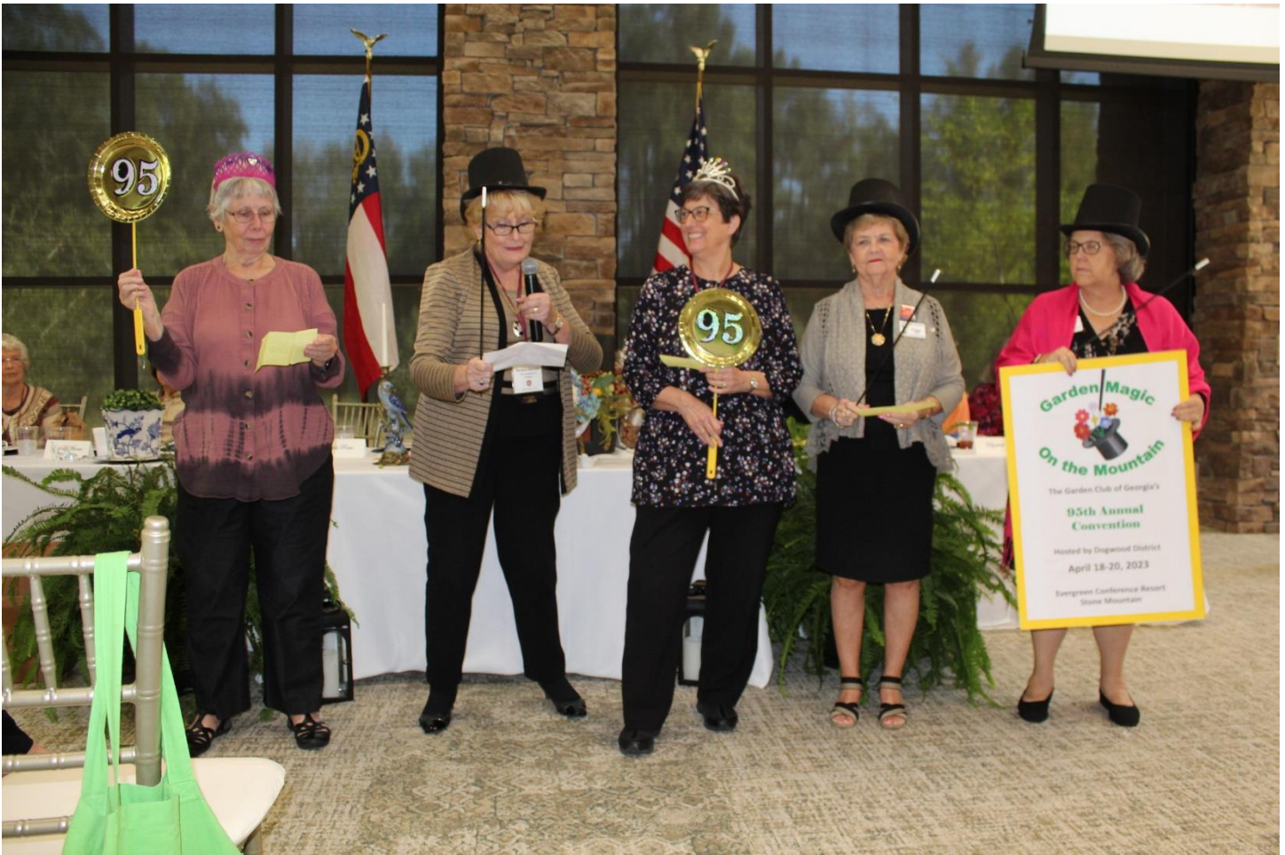
Invitation to GCG 95 th Convention “Magic on the Mountain”