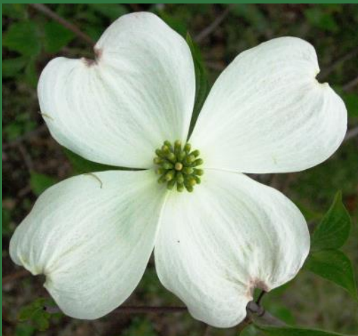
Proud Member of GCG since 1933

Piedmont Garden Club is one of the oldest garden clubs in Atlanta. The purpose of the club is to study and disseminate information about gardens and gardening, to promote general interest in horticulture and to contribute to the beauty of the city of Atlanta.