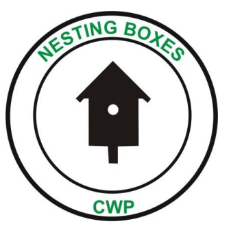
Each decal is $1.00. That includes tax and mailing.