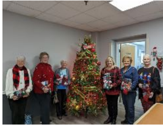
The Glad Garden Club of Swainsboro is shown presenting blankets and stockings to the residents at the Emanuel County Nursing Home.