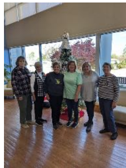
Members of the Glad Garden Club decorated the Emanuel County Hospital.