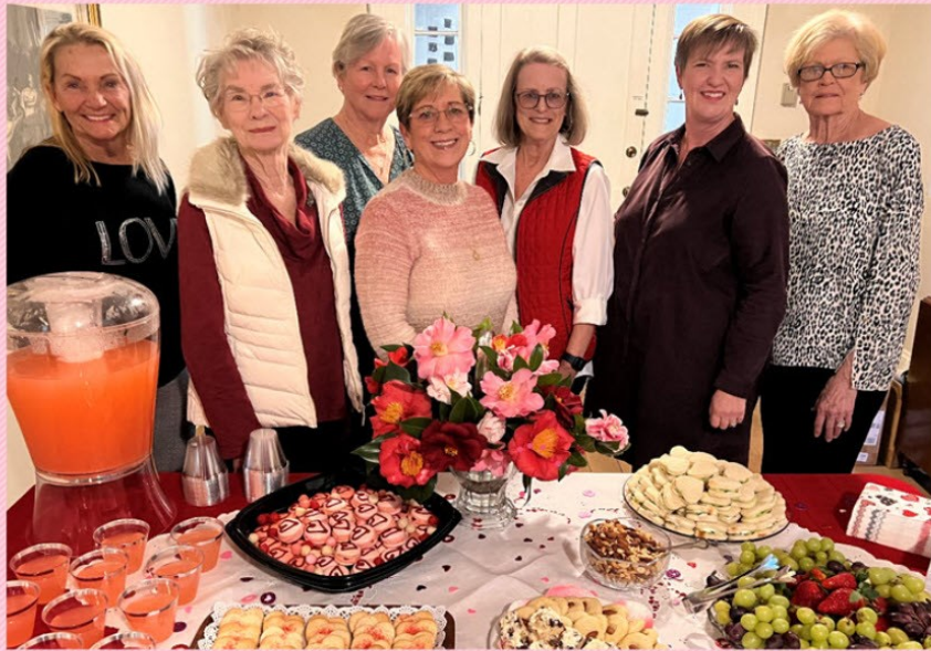
Milledgeville Garden Club