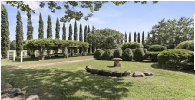
Serenata Farm & Boxwood