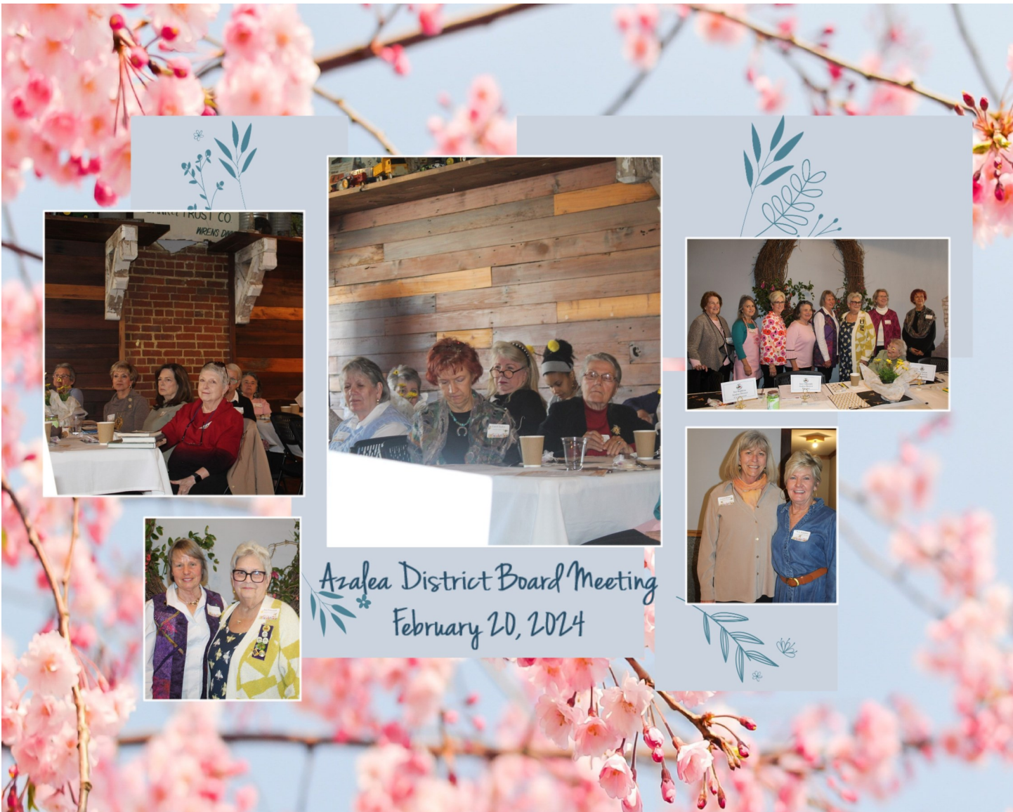
Azalea District Board Meeting February 20, 2024