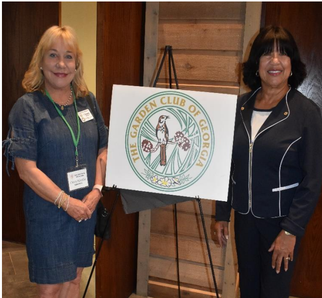
The Garden Club of Georgia, Inc Convention 2024 Memories