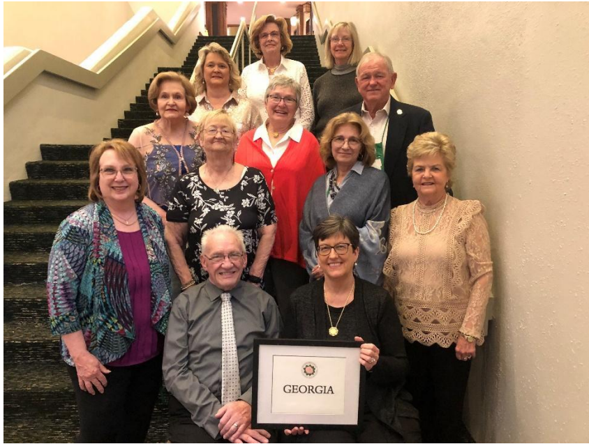
Deep South Convention 2024 Georgia Representatives