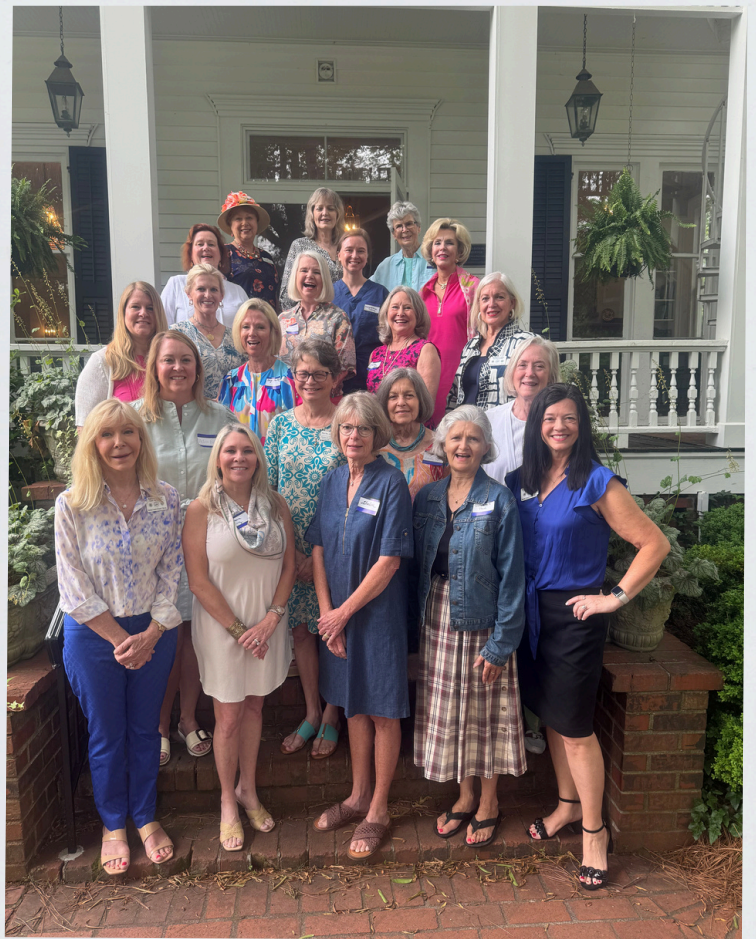
Marietta Council Officers hosted the second annual President's Luncheon at Fair Oaks to celebrate their positions and offer training as they made plans over summer break.

“ The Marietta Council of Garden Club is thrilled to be able to observe our Blue Birds and Nature. There have been three broods of fledglings at Fair Oaks this season. ”