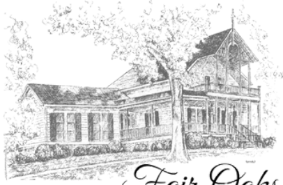
Fair Oaks CIRCA 1850