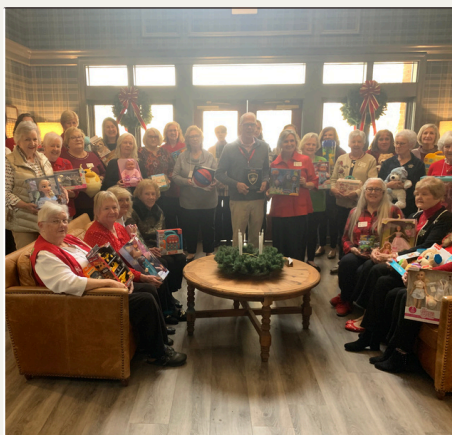
Magnolia Garden Club celebrates the Season.