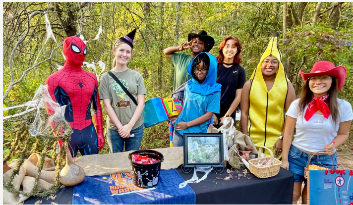
NCHS Greenhouse Gang sponsors Trick or Treat through the Meadow, donating candy and harvested seed packets.