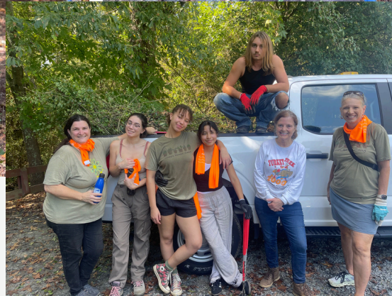
NCHS Greenhouse Gang volunteered to pull privet at Cobb County Leone Hall Price Park