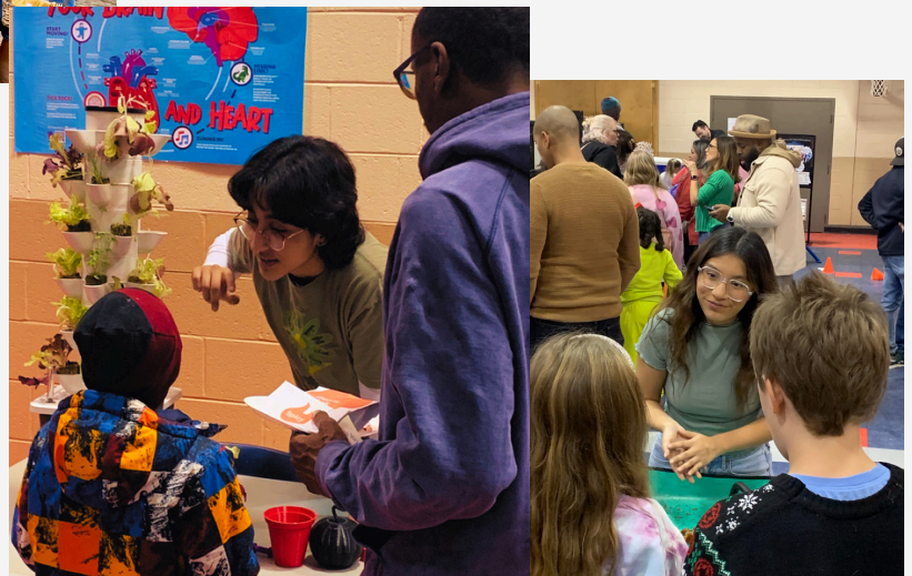
Baker Elementary STEM Night benefited from the NCHS Greenhouse Gang/Warriorponics club.