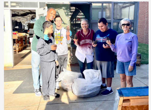
NCHS Greenhouse Gang Special Needs Transition students strengthened their functional skills by clearing the baseball field of fallen pinecones and donating them to the Sope Creek Garden Club for their Council Fall Festival event.