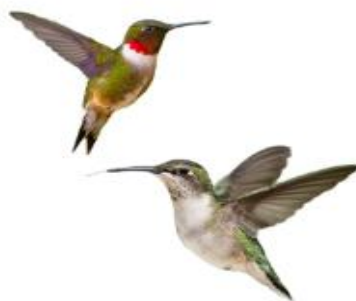
Male and female Ruby-throated Hummingbirds