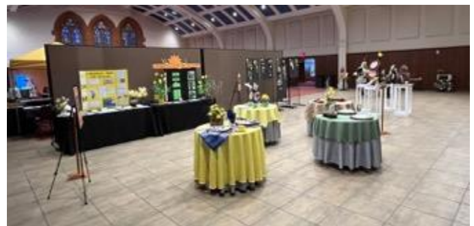
Top left: display of daffodil entries