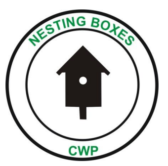
Each decal is $1.00. That includes tax and mailing.