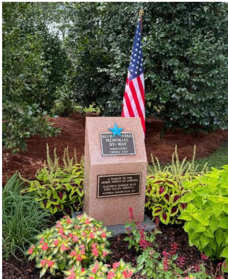
Post-refurbished Blue Star Memorial By-Way Marker!