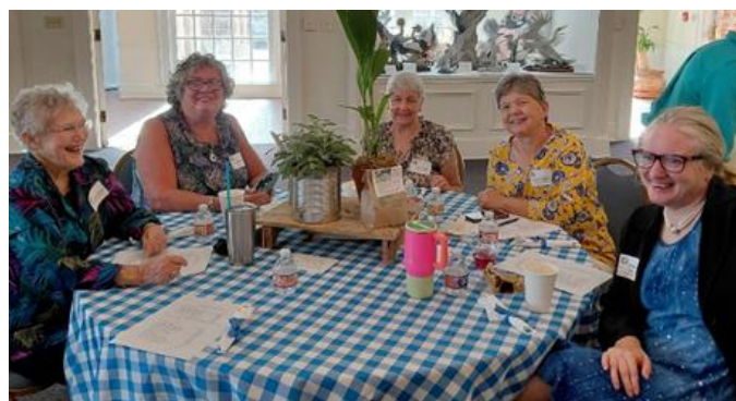
Photo right: Members of Village Green Garden Club of Byron, Georgia who enjoyed the meeting.