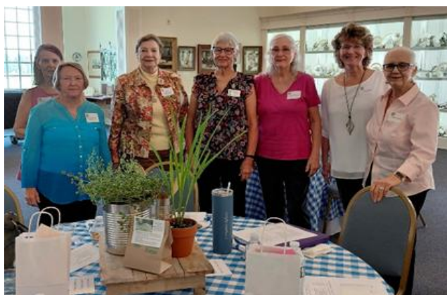
Photo left: Members of The Butler Garden Club, Butler and Reynolds, Georgia who attended the District Board meeting.