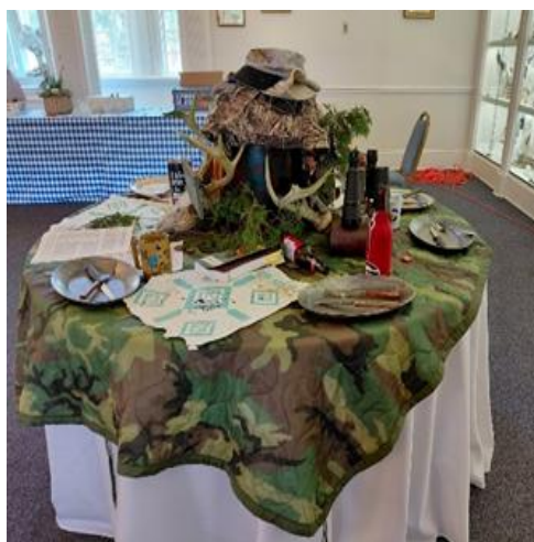
Fun Tablescape by Sybil Willingham

Landscape and tablescape designs share many common elements. What is a tablescape, you ask. It is a beautifully arranged dining table with carefully coordinated linens, China, flowers, candles, art objects all centered around a theme. The Butler Garden Club took part in Fantasy of Tablescapes held at Massey Lane in May 2025 hosted By Magnolia Garden Club of Fort Valley.