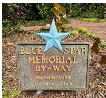
Blue Star By Way Marker usually unnoticed as it blended into the background.

On Wednesday, August 6, 2025, a re-dedication of a Blue-Star Memorial By-Way marker took place at Massee Lane Gardens. Blue Star Memorial By-Way Markers are sponsored by the National Garden Club and the Garden Club of Georgia. The Blue Star Memorial Marker Program honors all men and women, past, present and future who serve in the United States Armed Services. The program began with the planting of 8,000 Dogwood trees by the New Jersey Council of Garden Clubs in 1944, as a living memorial to veterans of World War II. In 1945, the National Council of Garden Clubs (now National Garden Clubs, Inc.) adopted the program and began a Blue Star Highway system that covers thousands of miles across the continental United States, Alaska and Hawaii. The Blue Star marker located at Massee Lane Gardens was placed there years ago and was in dire need of