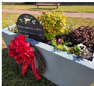
Downtown Brooklet Planters.