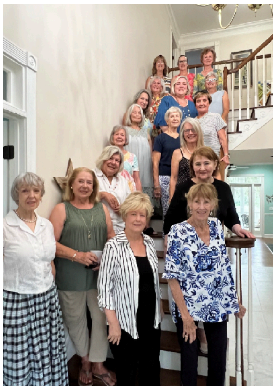
Club members gather for the last photo of the 2024-2025 year.