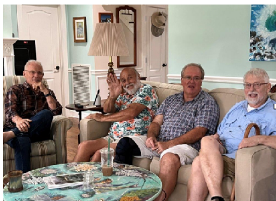
Spouses enjoy the get-together, too.