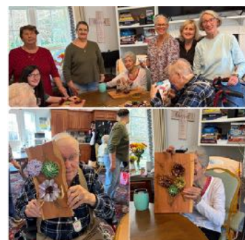
Craft project with residents of Willow Hill and Southern Manor Assisted Living Facilities.