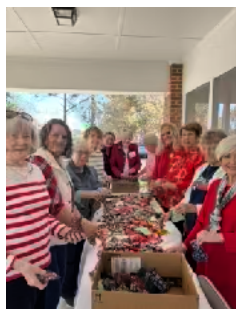
BGC members stuff Christmas Stocking with candy for the Ogeechee Area Hospice patients and families.