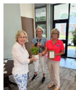
BGC presents floral arrangements to Core Credit Union and Morris Bank in celebration of National Garden Club Week.