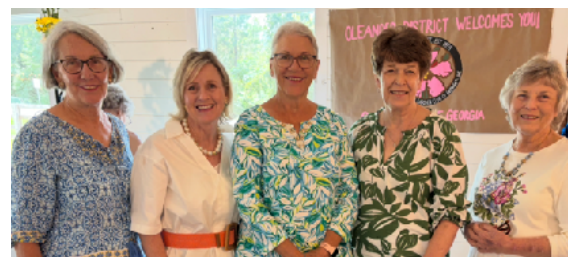
Brooklet Garden Club Oleander District Board Members attending the Oleander District Board Meeting.