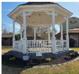
BGC and Brooklet Development Authority fund Brooklet Gazebo and Landscape Design